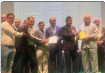
IMA Raichur Branch: IMA National President's Appreciation Award for Maximum Units of Blood Collected Trophy of a Local Branch