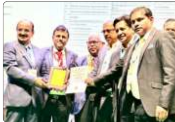
IMA Yelahanka Branch: Best IMA Local Branch Rotating Trophy of Gujarat State Branch